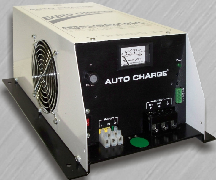
MODEL # 091-143-12

The Euro Charger II VHO is a fully automatic battery charger designed to meet CE requirements. Ruggedly constructed with a very high dual output, it float charges the battery and may be installed on the vehicle. Extremely precise voltage control maintains the charger output constant with variations in load or line voltage input. Active current limiting, limits the output current so as not to exceed its rated value when charging deeply discharged batteries or if the vehicle is started while charging.